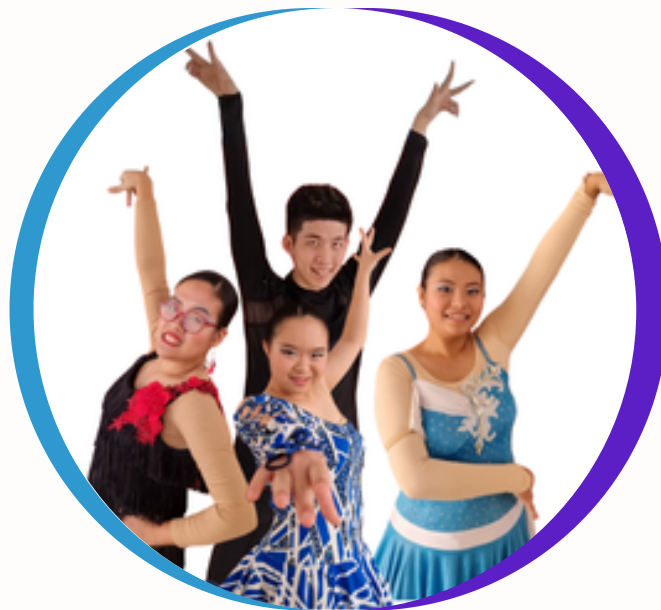
DanceSport 3 Female, 1 Male